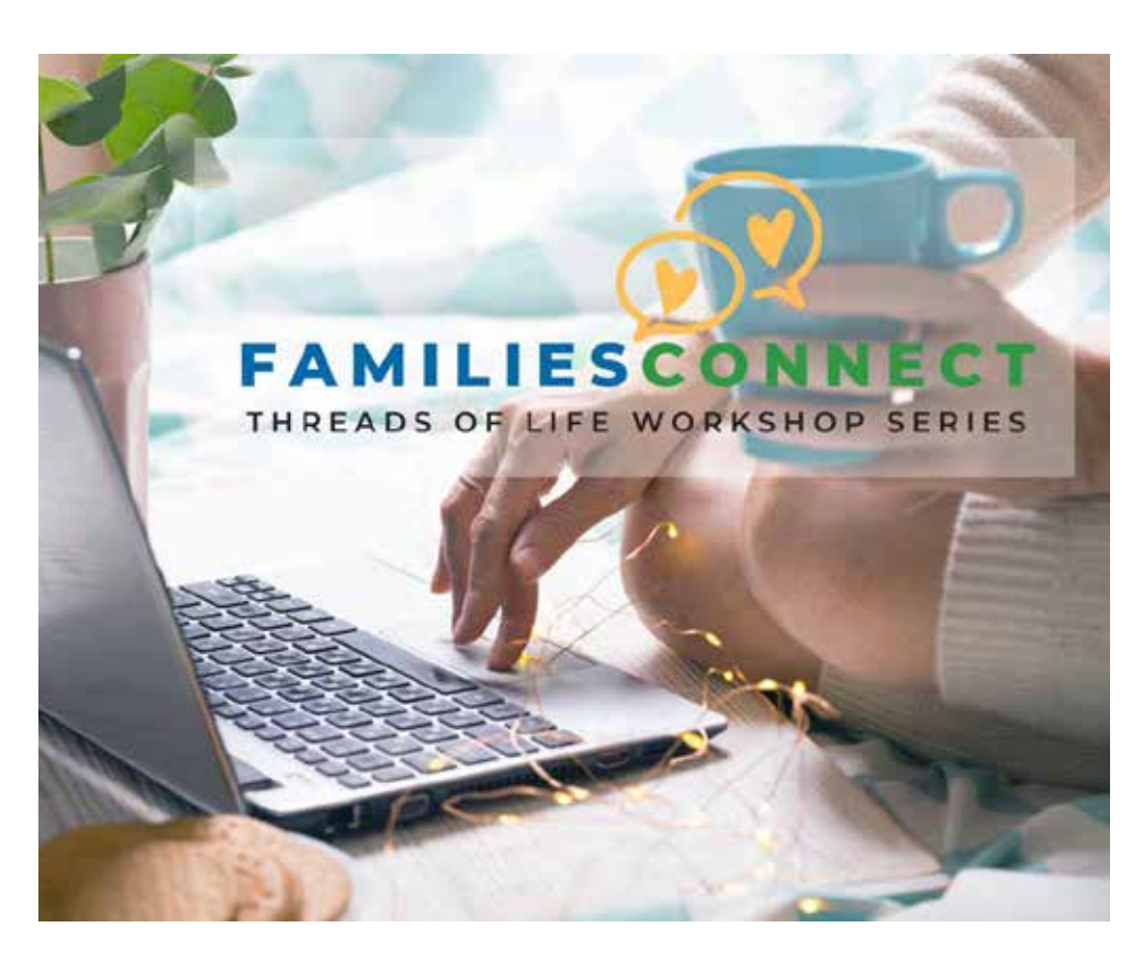
Mar. 27, 2024: Living Well With Chronic Pain — This interactive workshop provides information and practical skills in dealing with the pain, frustration, fatigue, and difficult emotions associated with chronic pain, giving you more confidence and motivation to manage the challenges.

Feb. 21, 2024: Zentangle Art Session — This session will be a beginning guide to the Art of Zentangle, a way of drawing that is so simple, yet creates intricate patterns. Zentangle can help to calm anxiety, increase self-confidence, and cultivate mindfulness. You'll learn how to draw some of the standard Tangles and a few new ones!