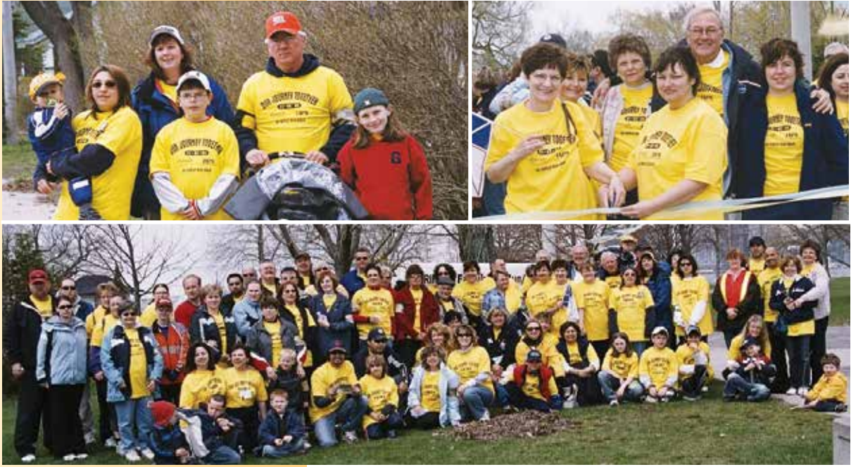
2005 fundraising walk includes participants from coast to coast