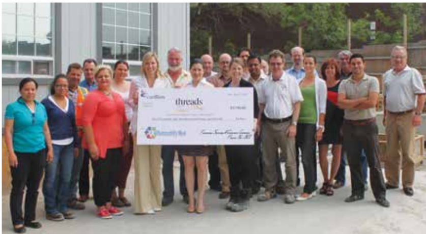
Carillion donates after Charity of Choice fundraiser