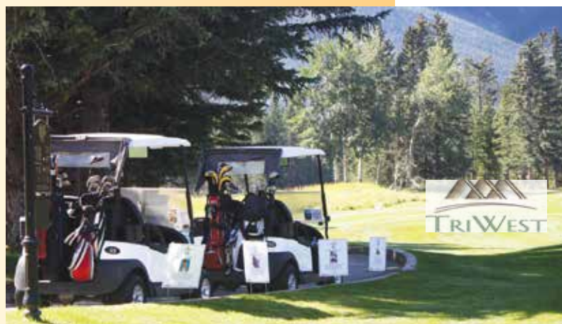
TriWest Capital Partners Event