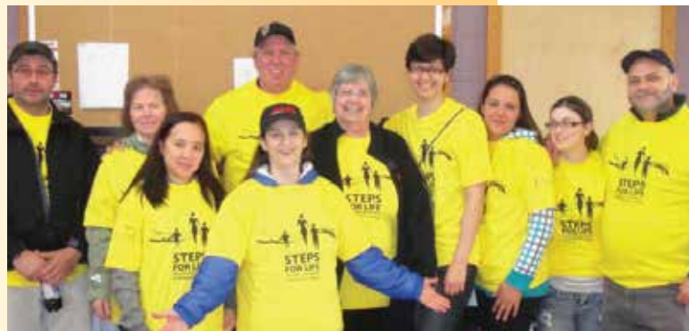
Alta-Fab teams win first corporate challenge