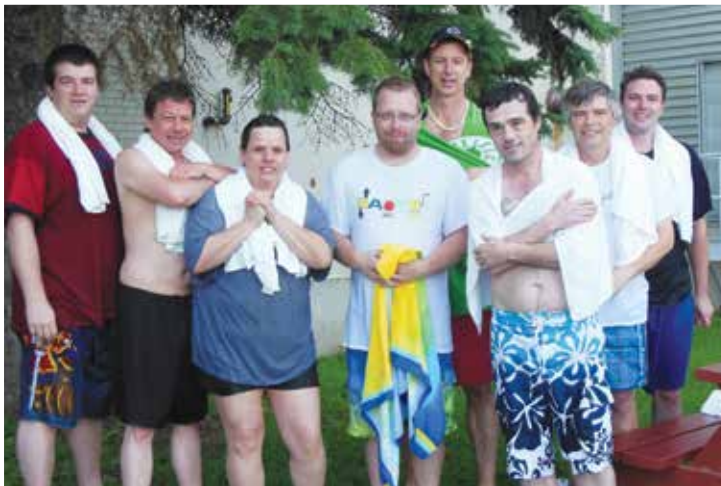
Giant Tiger dunk tank for Charity of Choice