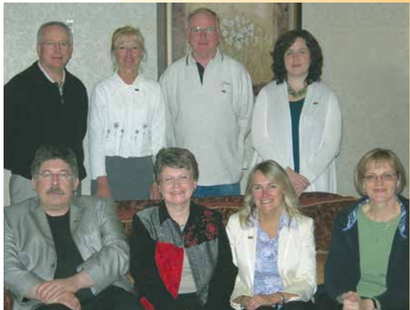
2006 First Board of Directors