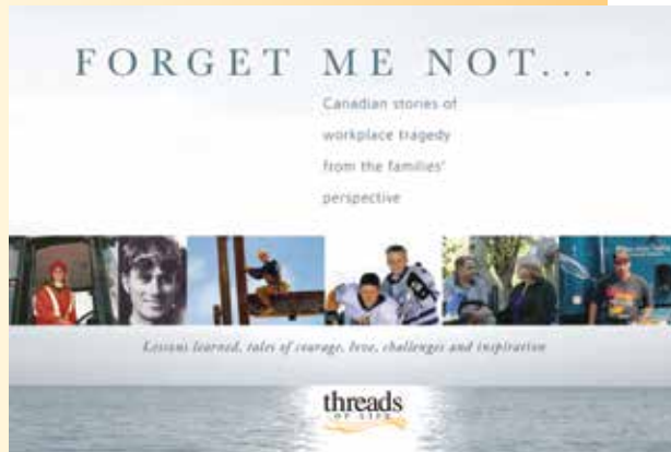
Forget Me Not—Canadian Stories of Workplace Tragedy

Association for Workplace Tragedy Family Support Association de soutien aux familles des victimes de tragedie au travail