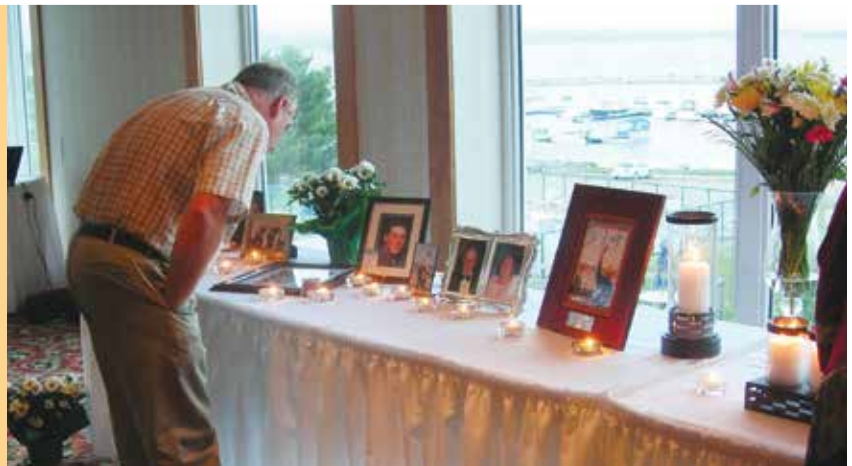
Lower R: Atlantic Canada Family Forum