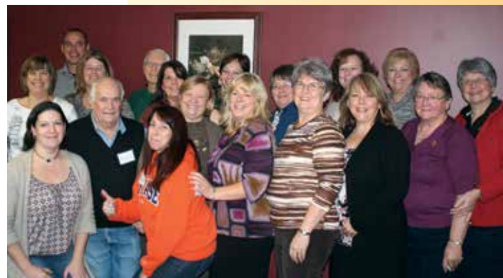
Advanced Volunteer Family Guide training 2012